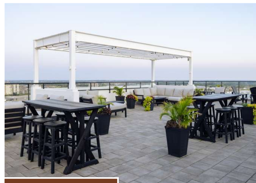
Sofia - Roof Top Lounge