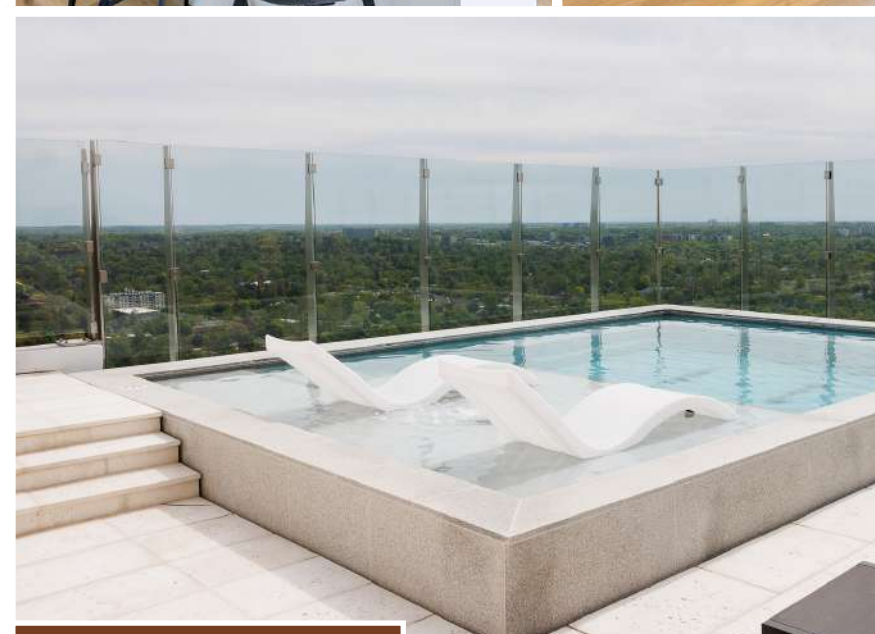
Aqui - Social Lounge